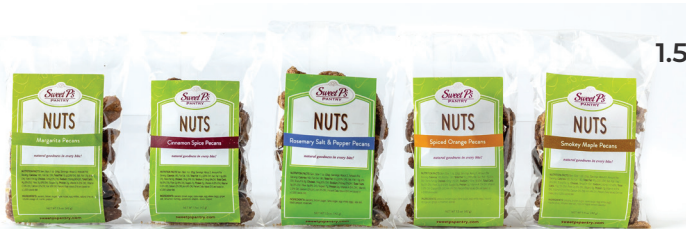
1.5 Oz Snack Bag

Available in: Rosemary Salt & Pepper 🏆 | Margarita 🏆 | Spiced Orange | Smokey Maple | Cinnamon Spice