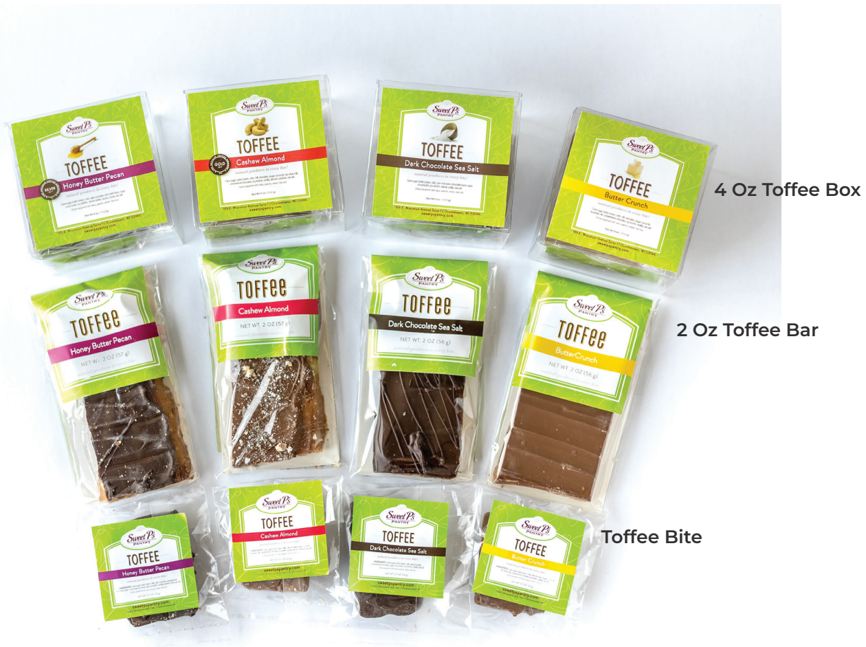
4 Oz Toffee Box

Available in: Milk Chocolate Cashew Almond 🏆 | Milk Chocolate Butter Crunch | Dark Chocolate Honey Butter Pecan | Dark Chocolate Sea Salt | Ruby Cherry Almond