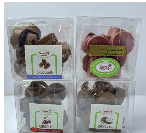
4 OZ CHOCOLATE CLUSTER