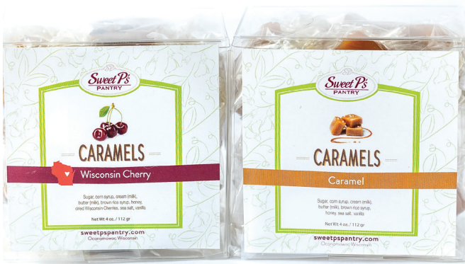
4 Oz Caramel Box

Available in: Plain Caramels | Wisconsin Cherry Caramels 🍒 | Chocolate Covered Caramel, Milk & Dark