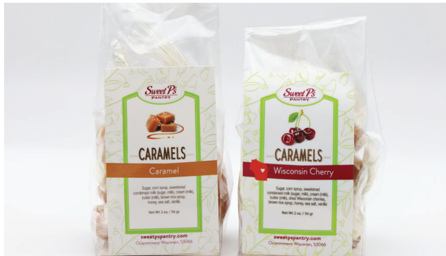
2 Oz Caramel Bag