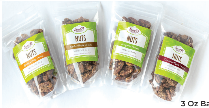
3 Oz Bags