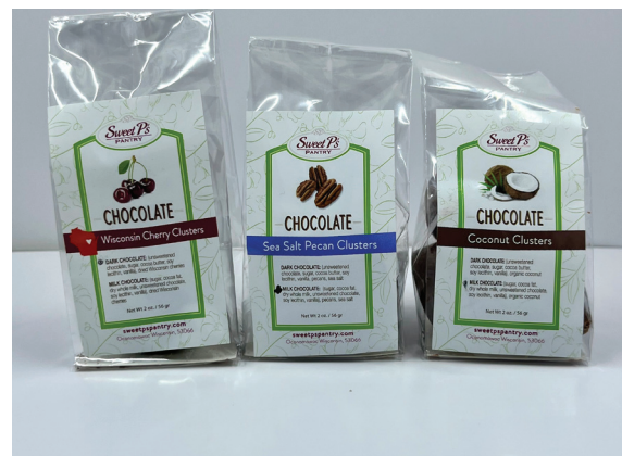
2 OZ CHOCOLATE CLUSTER