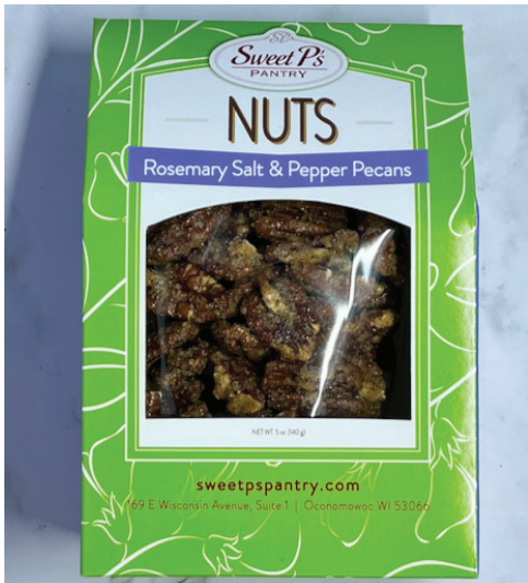
5 Oz Gift Box

[Only available in Rosemary Salt and Pepper]