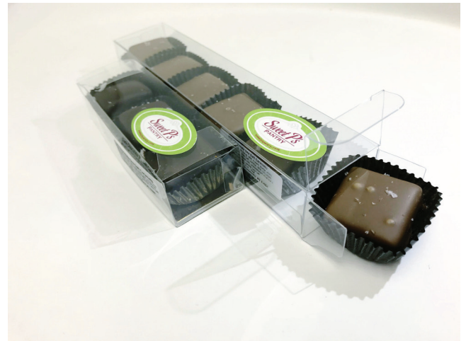
Chocolate Covered Caramel